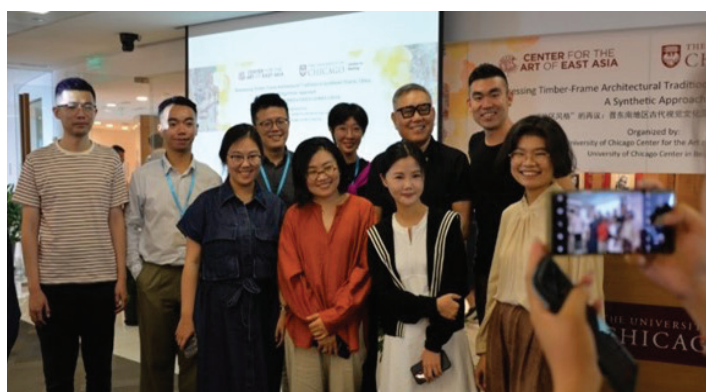
Attendees of the 2-day seminar on Reassessing Timber-Frame Architectural Traditions