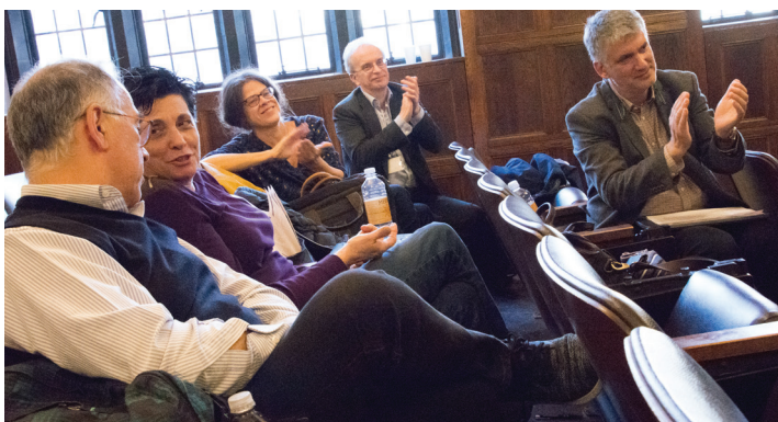
Researchers from the CNRS and UChicago at the IRL HumanitiesPlus's first conference