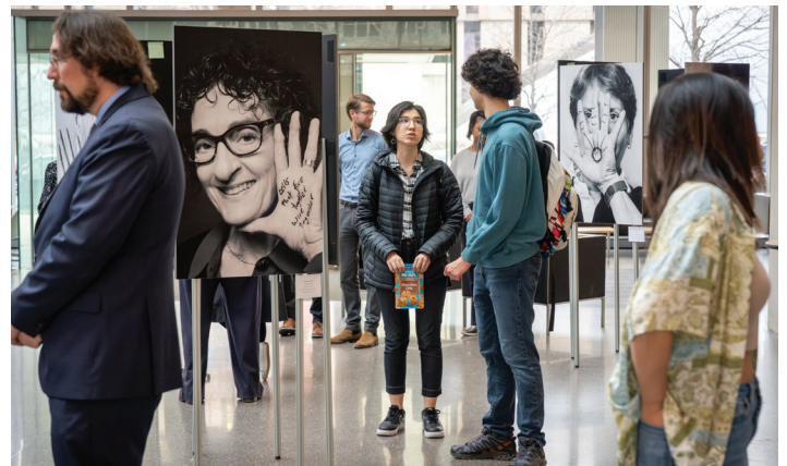
Attendees at the Fascination of Science Photo Exhibit

In partnership with the German Consulate in Chicago , the Division of Physical Sciences , and the Pritzker School of Molecular Engineering , UChicago Global presented a photo exhibit in the atrium of the William Eckhardt Research Center in April 2024. The exhibit featured the creative work of celebrated German photographer Herlinde Koelbl. Koelbl's project involved interviewing and photographing 60 of the world's leading scientists, inviting them to draw the essence of their research on their hands. The exhibit explored the unique and innovative intersection of art and science, inviting attendees to engage with the visual narratives of scientific discovery and exploration while promoting the collaborations between UChicago and Germany.