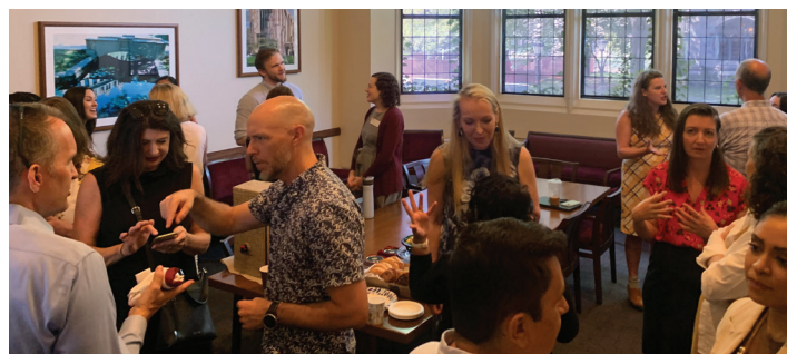
Members of the Global Partners Network at a quarterly, in-person networking gathering

This year's virtual meetings included presentations by the Faculty Directors of the Center in Delhi , Center in Beijing , Yuen Campus in Hong Kong , and Institute for the Study of Ancient Cultures , as well as presentations by the Executive Directors of the Neubauer Collegium and UChicago Booth Robert Rothman '77 London Campus . The GPN also received updates on the NSPM-33 Research Security Provisions, newly created external and internal websites, recommendations for hosting international delegations, overview of Chicago Consular Corps, the Provost Global Faculty Awards, and Alumni Relations and Development's vision and priorities. GPN members had the opportunity to meet in-person with the Executive Directors of UChicago's Global Centers in Beijing and Delhi and Campus in Hong Kong, who visited Chicago in December.