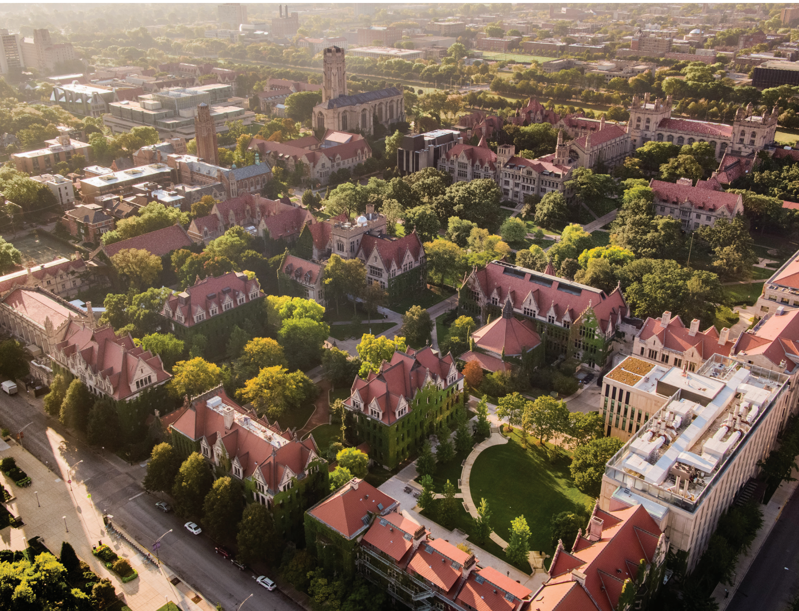
A bird's-eye view of the University of Chicago's Hyde Park campus

We share best practices, address operational barriers, and connect you to resources to develop your international initiatives.