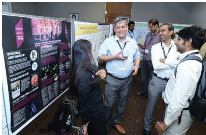
Scene from the UChicago-IIT Bombay Workshop

All UChicago faculty projects conducted in India this year were branded under the 10th Anniversary banner, extending the celebration and recognition of a decade of impactful collaboration. The Center in Delhi acknowledges the dedicated efforts that have led to this moment, as it sets into motion a full array of globally impactful research and programming in the years to come.