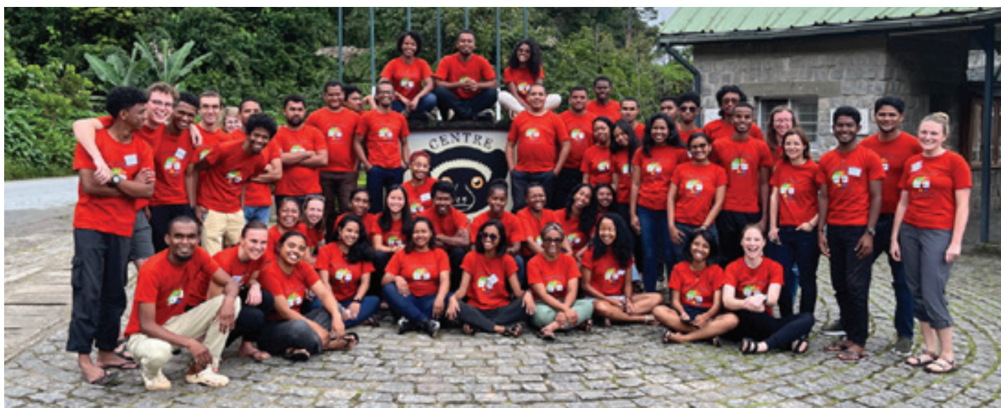
Malagasy graduate students and UChicago participants of the workshop