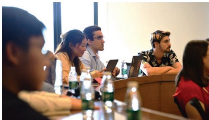
Students participating in the Wanxiang Ambassador Fellows Green Energy Conference

The Wanxiang Ambassador Fellows Program is a 5-week pre-professional summer fellowship for students to expand their knowledge of Chinese renewable energy development and language and culture and interact with peer students. As part of the program, the Center in Beijing hosted the 2024 Wanxiang Ambassador Fellows Green Energy Conference. The conference was a three-day event in June that invited leading professionals and academics in the field of green energy to lead a series of lectures and discussions on topics such as China's environmental regulations, policies toward carbon neutrality, the development of photovoltaic power, renewable energy integration, and the future of hydrogen and wind energy.