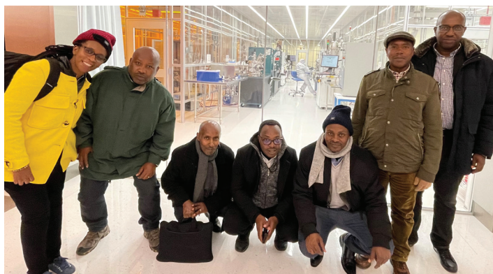
University of Rwanda delegation visiting the Pritzker Nanofabrication Facility