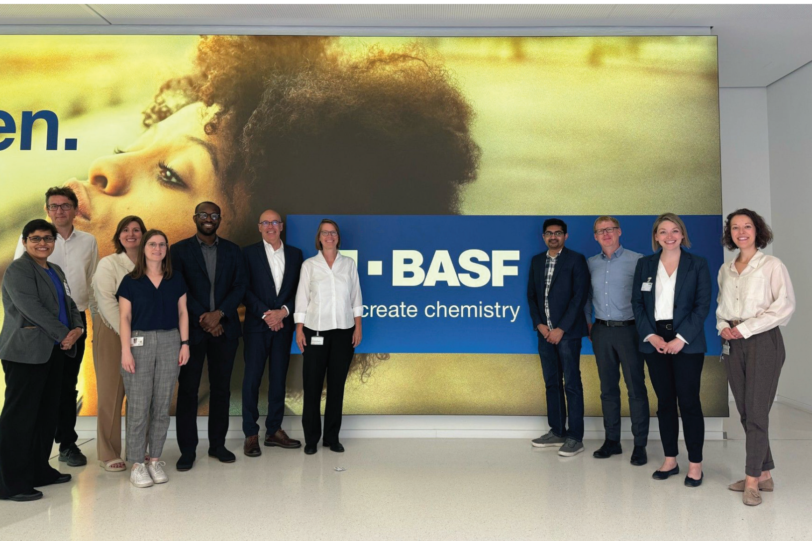
UChicago faculty and staff with BASF leadership at BASF's headquarters in Ludwigshafen

We support partnerships with institutions and governments abroad to facilitate mobility, joint programs, fellowships, and other programs & activities.