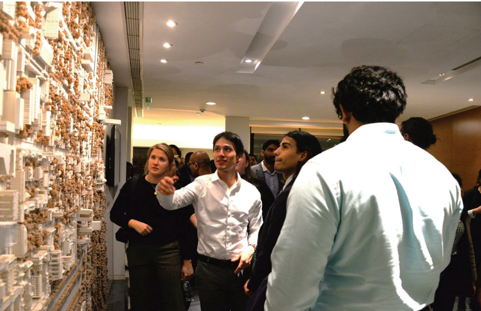
Students visitors to the Center in Beijing

We meet the needs of faculty, students, and staff; engage local communities; and build relationships with key regional partners through the Centers in Beijing and Delhi and the Campus in Hong Kong, and in coordination with the University's other global locations in Paris, London, Luxor, and Dhaka.