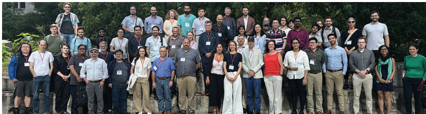
Participants of the CECAM-US-Central Node's first conference at UChicago

The Node officially launched in July 2024 at UChicago with a three-day conference titled "Frontiers of Computational Reaction Prediction." The conference brought together 60 researchers from around the world to discuss polymer design, drug discovery, and quantum chemistry, among others, exploring the use of artificial intelligence, machine learning, and other computer modeling innovations to tackle the world's biggest challenges.