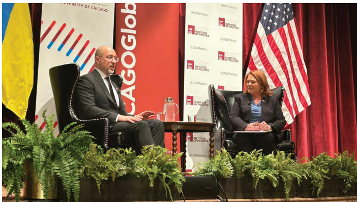
(from left) Prime Minister of Ukraine, Denys Shmyhal, and Institute of Politics Director, Heidi Heitkamp, in conversation

UChicago Global collaborated with the Institute of Politics, the Polsky Center for Entrepreneurship and Innovation , and International House to host the Prime Minister of Ukraine, Denys Shmyhal, for a conversation about resilience and reconstruction in April 2024. In a discussion moderated by Institute of Politics director Heidi Heitkamp, Prime Minister Denys Shmyhal discussed the impact of war on Ukraine's economy, what post-war reconstruction might look like, and explored innovations and recovery efforts. He took numerous questions from the audience, which was comprised of 255 students, faculty, staff, government officials, and community members.