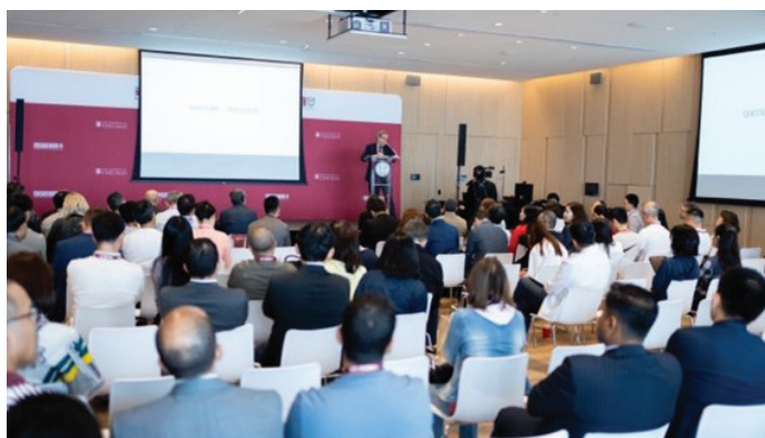
Attendees of the Campus in Hong Kong and Chicago Booth Anniversary event