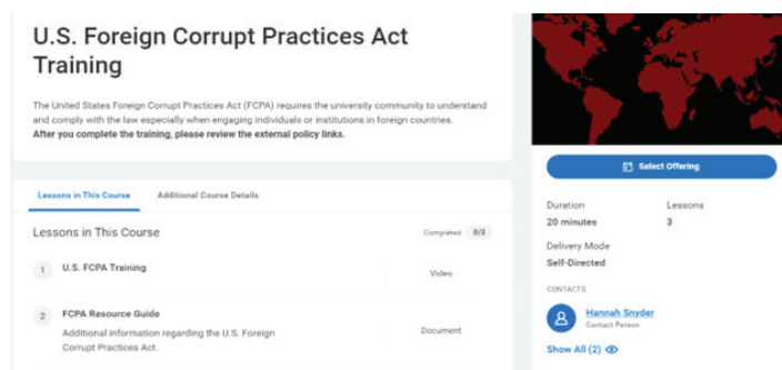
FCPA Training on Workday Learning

The United States Foreign Corrupt Practices Act (FCPA) prohibits the bribery of foreign officials. This year, UChicago Global developed a new FCPA training within Workday Learning to inform the University community on how best to comply with regulations when engaging with individuals or institutions in foreign countries. The training provides clarity on the FCPA and UChicago's FCPA policy and reduces risk for the University, as noncompliance may have legal and financial implications. The training will go live in the Autumn Quarter and is recommended for all UChicago faculty and staff who engage with international partners.